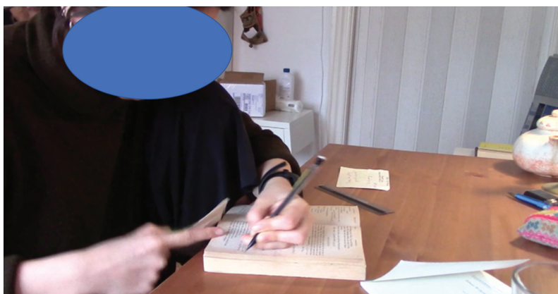
Figure 3. Student 1's transitions between sub-tasks such as reading-writing.