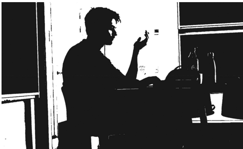
Figure 4. Student 3's embodied frustration when an impasse is reached.

a different characteristic. The empirical feature of voice is different from scanning text. Further, she also allowed herself a moment of being 'task off-road'. To be comfortable in being task off-road requires that one has faith that the local detour eventually will bring one back on track. In this case, the student's detour might be more intelligent than trying to solve the problem locally. Eventually, the student proclaimed, the meaning would sediment when she progressed in the text. Not necessarily in the sense that she would comprehend the exact meaning of every word but enough to enjoy the narrative and move on in the text.