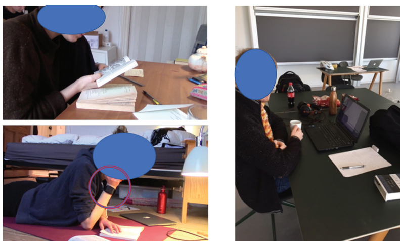
Figure 2. The three students' preferred reading locations.